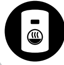
Hot Water Unit